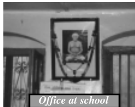
Office at school